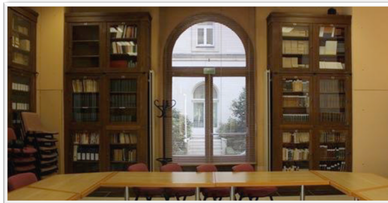
Salle de séminaires 1