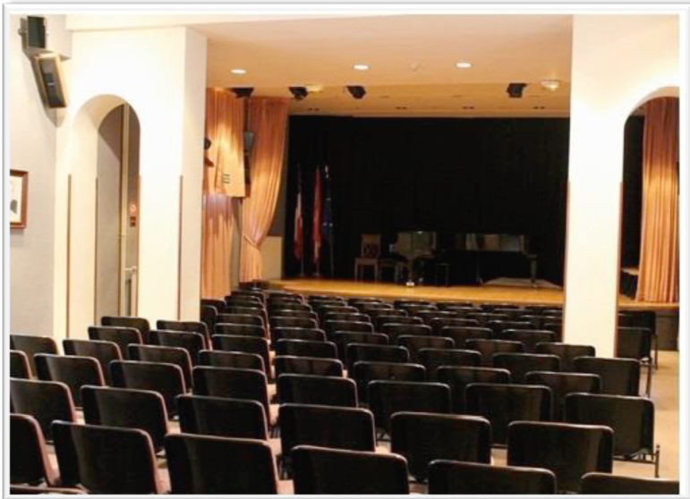
Salle Luis Bunuel